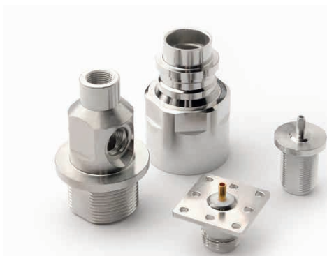
Miralloy® electrolytes are worldwide used for coating nickel-free RF-connectors of leading manufacturers.